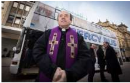
The double-decker bus will tour Greater Manchester and Lancashire and have priests available to hear Confession.

Pope Francis has given his blessing to the Diocese of Salford's Mercy Bus, which will soon be touring parts of Greater Manchester and Lancashire.